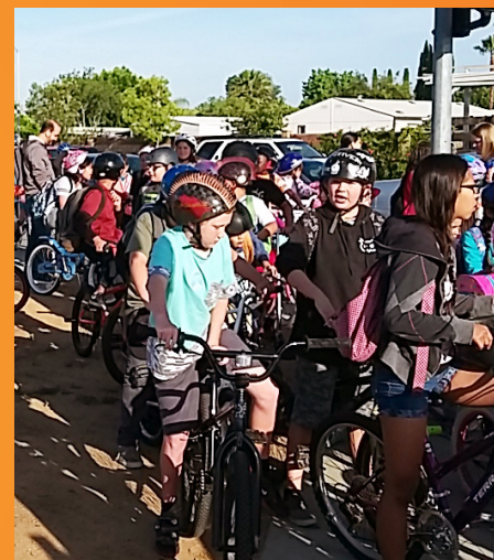
Escondido Education COMPACT