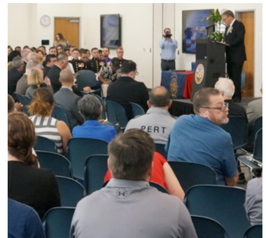
2016 Veterans Forum

Read the full 2016-2017 Partners Report online: LiveWellSDPartnersReport.org