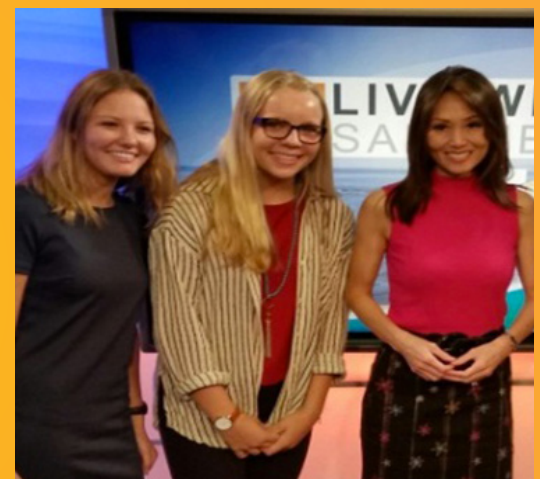
Carlsbad Unified School District