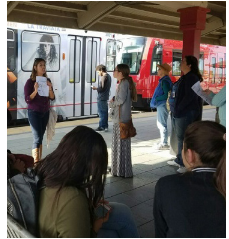
City of El Cajon - Circulate San Diego

They hosted several outreach events, including the Walk This Way program that educated students about personal safety, road safety and safe walking habits. Circulate San Diego also coordinated four Transit Use Trainings where community members learned how to read transit maps and time tables, plan a trip, purchase a ticket and transfer between vehicles — all vital components to building community confidence on how to use the transit system.