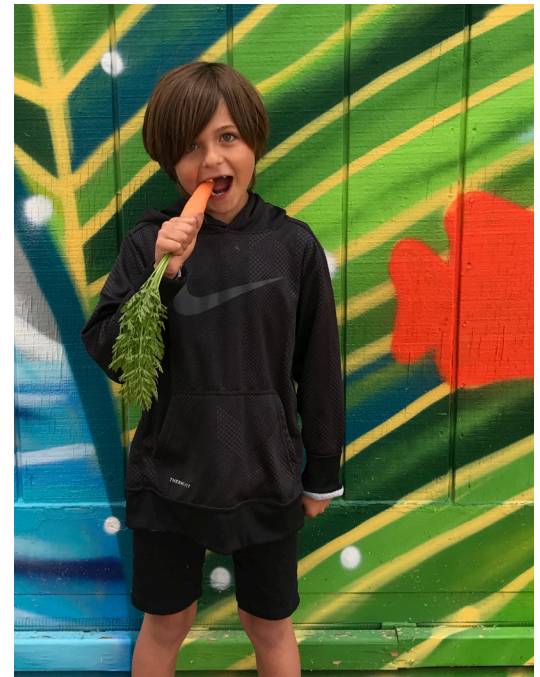
Encinitas Union School District

The Farm to School Program harvested 5,000 pounds of produce and enough lettuce each week to supply all nine daily salad bars in the District throughout the school year, and enough tomatoes to roast and freeze as pizza and marinara sauces for all nine schools for the entire school year. The Farm Lab builds upon the successes of past farm to school approaches through its onsite school location and full integration of DREAMS, an educational approach that incorporates design, research, engineering, art, math, and science into standards-based, hands-on lessons. This furthers each student's ability to build healthy habits through learning, exploration and activities.