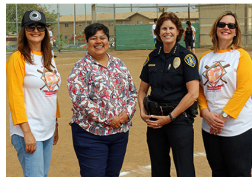
San Diego Unity Games

Read the full 2016-2017 Partners Report online: LiveWellSDPartnersReport.org