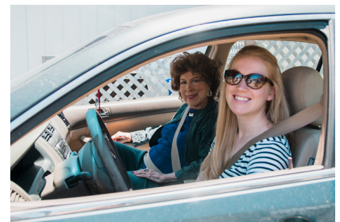
ElderHelp of San Diego