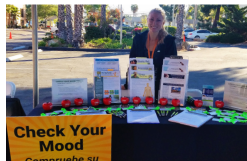
Check Your Mood