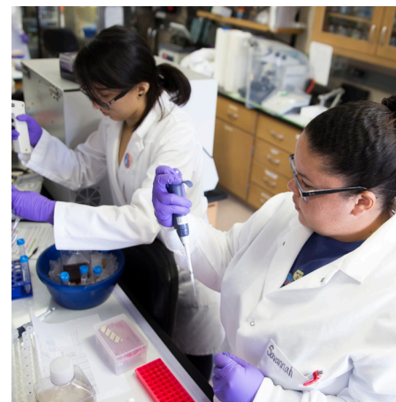
Cal State San Marcos

While there are other engineering programs in Southern California, the study highlighted how CSUSM is in a prime position to draw from existing curricula and faculty expertise while appealing to the hiring needs and goals of local industry.