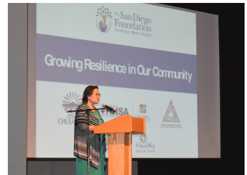
Growing Resilience in our Community