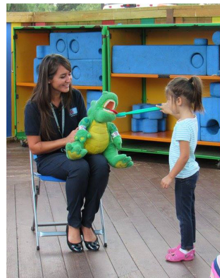
San Diego Children's Discovery Museum