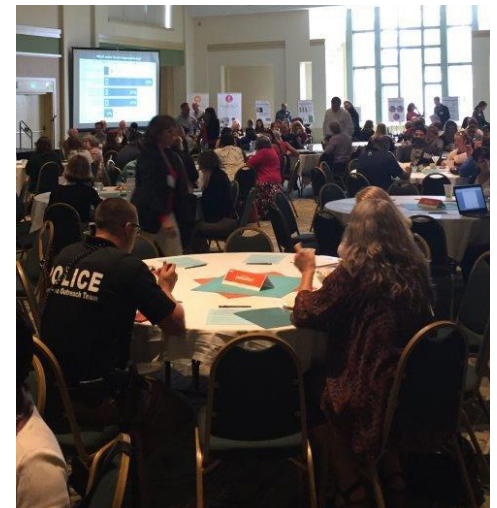
North County Thriving Forum

Read the full 2016-2017 Partners Report online: LiveWellISDPartnersReport.org