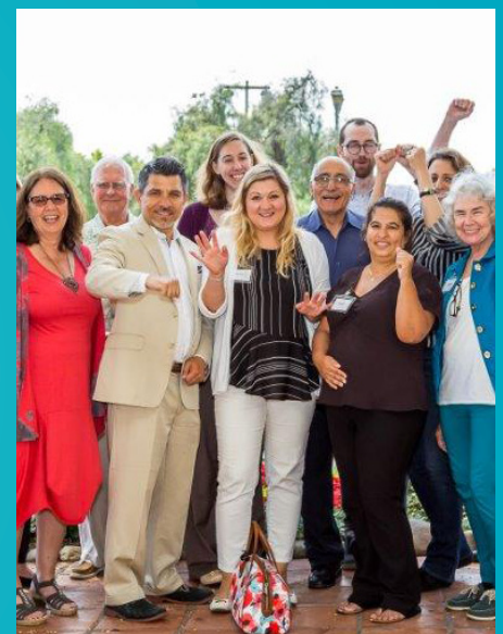
Survivors of Torture, International

Read the full report online: LiveWellSDPartnersReport.org