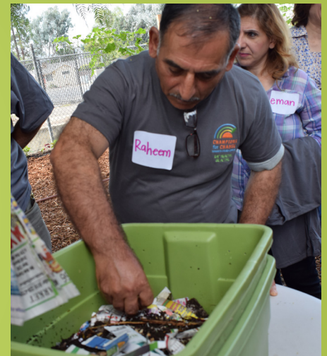
Union of Pan Asian Communities

Read the full report online: LiveWellSDPartnersReport.org