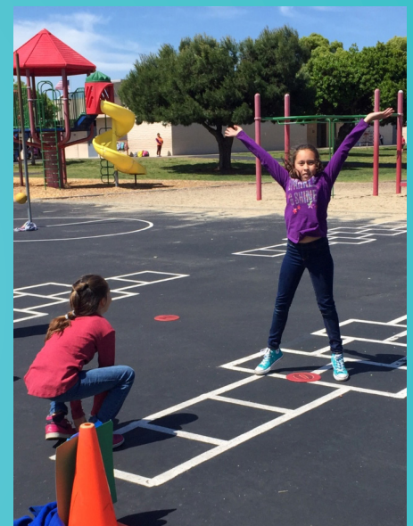
Chula Vista Elementary School District

Read the full report online: LiveWellSDPartnersReport.org