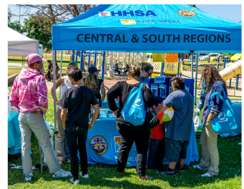
Let's Connect EXPO

Read the full 2016-2017 Partners Report online: LiveWellSDPartnersReport.org