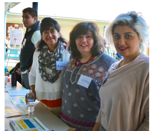
Let's Connect Event

Read the full 2016-2017 Partners Report online: LiveWellSDPartnersReport.org