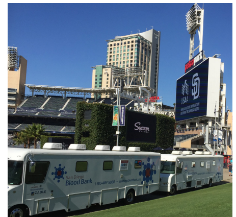
San Diego Blood Bank