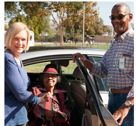
Jewish Family Service of San Diego

With funding from The San Diego Foundation's Age-Friendly Communities grants, Jewish Family Service of San Diego launched a breakthrough service, On the Go: Navigator. The app connects with ride-sharing companies like Lyft and Uber to offer riders ages 60 and older safe, same-day transportation anywhere in San Diego County. To date, the program has provided more than 300,000 rides for seniors and operates its transportation service without regard to race, color and national origin.