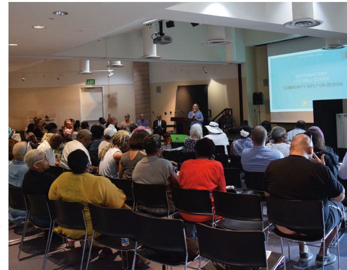
Community input on the design for new Live Well Center

Key Partners Involved: Lemon Grove HEAL Zone, Project New Village, The Urban Collaborative Project, the Healthiest Cities & Counties Challenge and the Live Well San Diego Central Region Advisory Committee