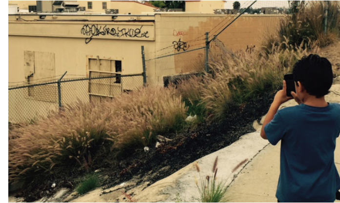
Taking photos to create change

Key Partners Involved: SAY San Diego, Rady Children’s Hospital, Monroe Clark’s Cinco de Mayo con Orgullo Coalition