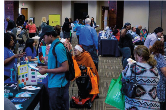
Grandparents Raising Grandchildren Symposium and Let’s Connect Expo

Key Partners Involved: Assertive Family Solutions, Grandparents Connection, Urban Collaborative Project, GRID Alternatives, Inner City Athletic Program, Mental Health America, SAY San Diego