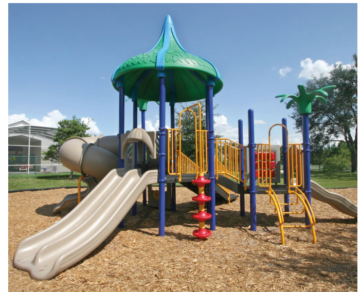
Smoke-free areas in East County

Key Partners Involved: Grossmont Union High school, Monte Vista High School, County Parks and Recreation Department, Spring Valley Coalition