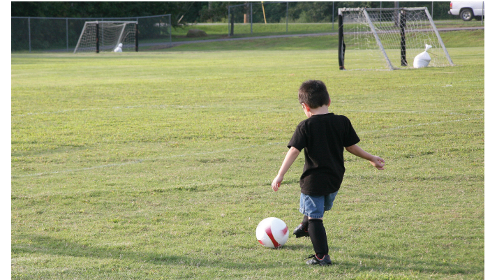
Joint use agreements open school fields for public use

Key Partners Involved: Grossmont Union High school, Monte Vista High School, County Parks and Recreation Department, Spring Valley Coalition