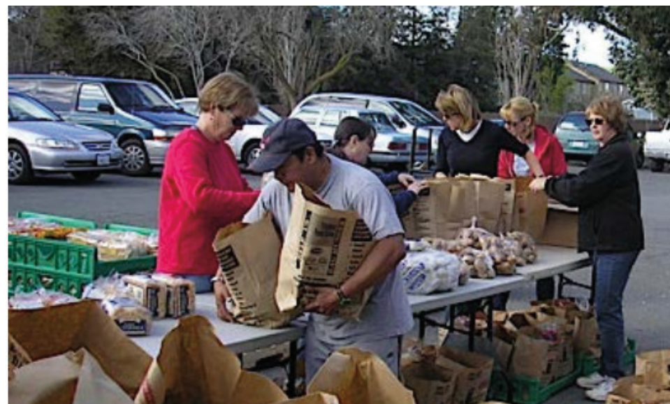
A food distribution site in East County

Key Partners Involved: Lemon Grove HEAL Zone, El Cajon Collaborative, Home Start, Mountain Health, International Rescue Committee, La Maestra Health Center, Educate to Eliminate, UC San Diego, SAY San Diego, American Red Cross WIC, Meals on Wheels