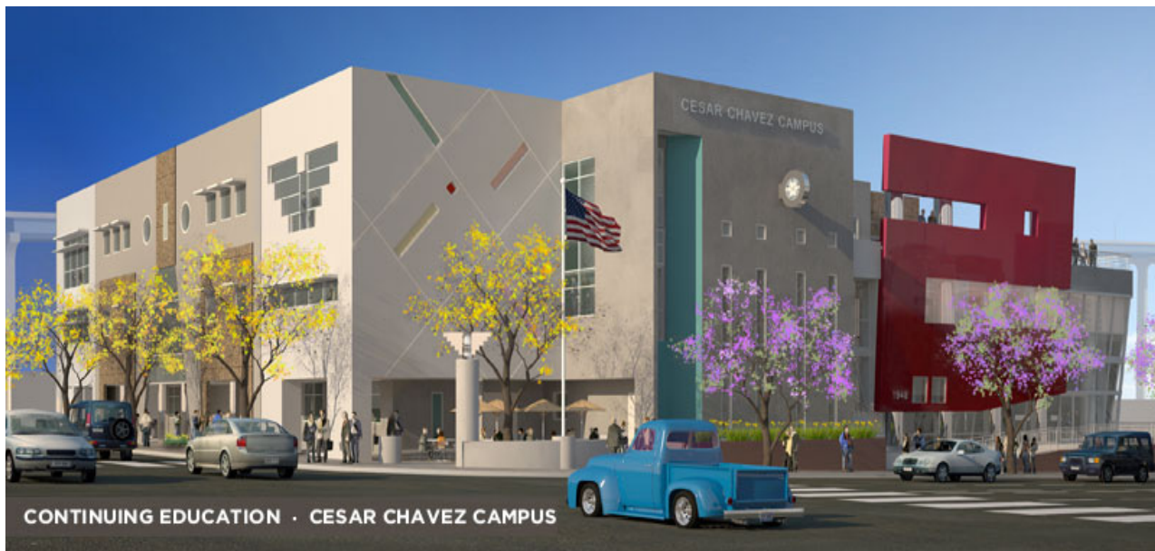
Official Facebook Image