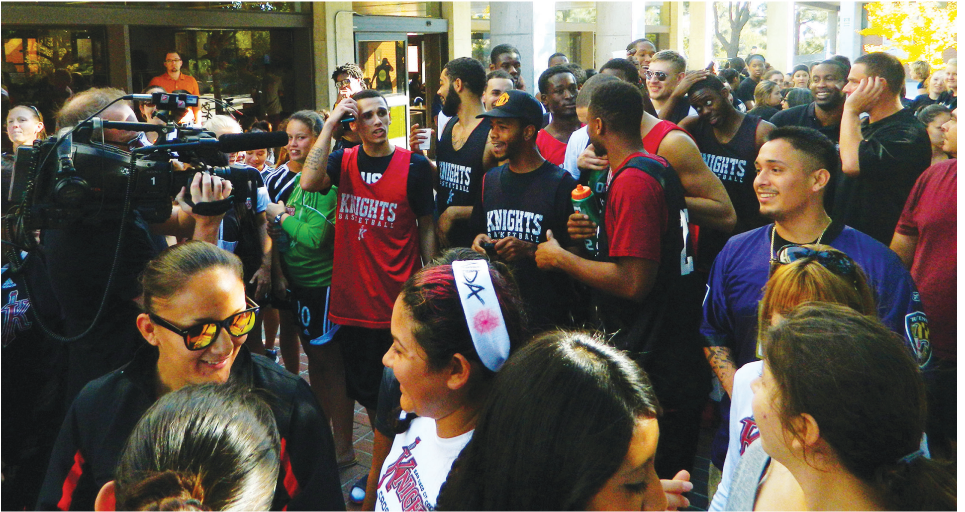
The basketball team, other Lady Knights squads, faculty, local media and students prior to the 2K Fun Run that started in the Gorton Quad and wound through campus.