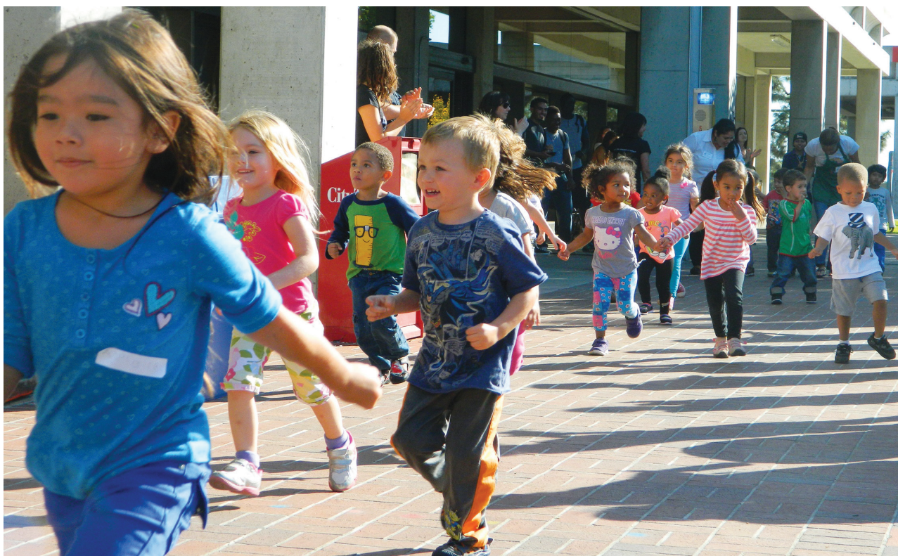
Kids run in the quad before City College and county officials kicked off the fun run.